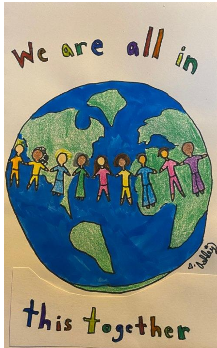
Illustration I made in response to the current hyper-xenophobic climate