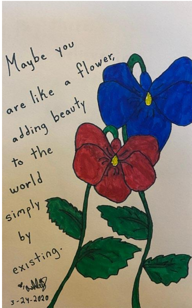
It was nice to learn a new style for drawing flowers.

Ashley Lilly: Passion Project Artwork April 2020