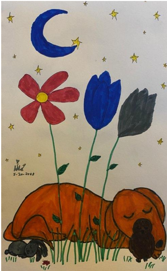
Unlikely friends are often the best friends.