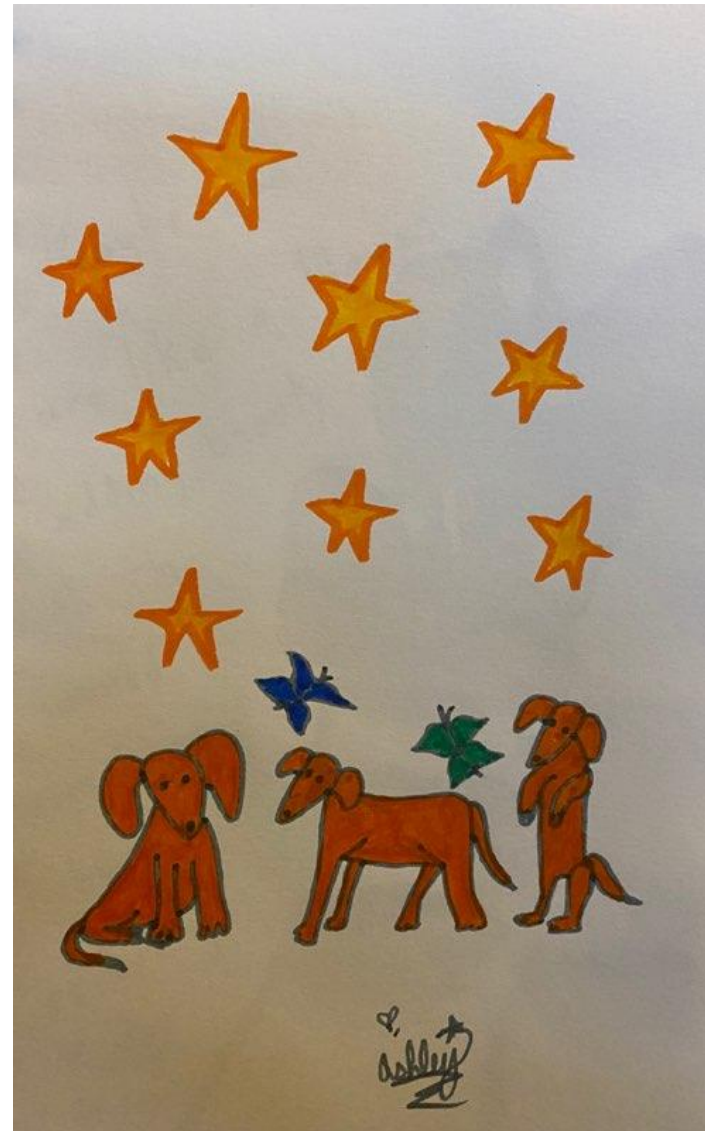
The universe reminds us to make time for play.