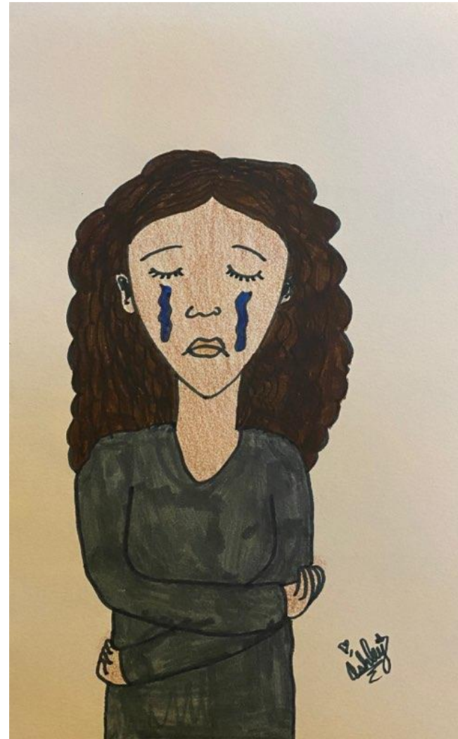
Crying on paper can be cathartic.